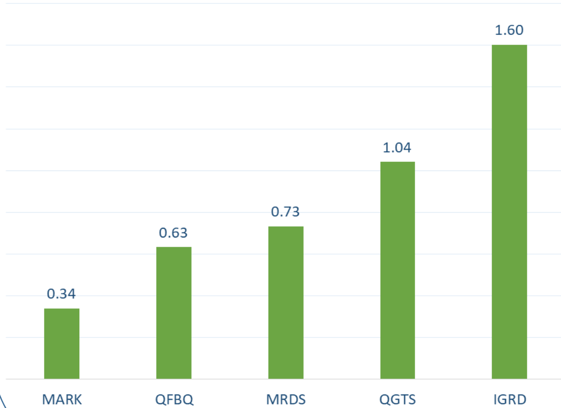
Top 5 Companies bought (net) by Foreigners in the last session