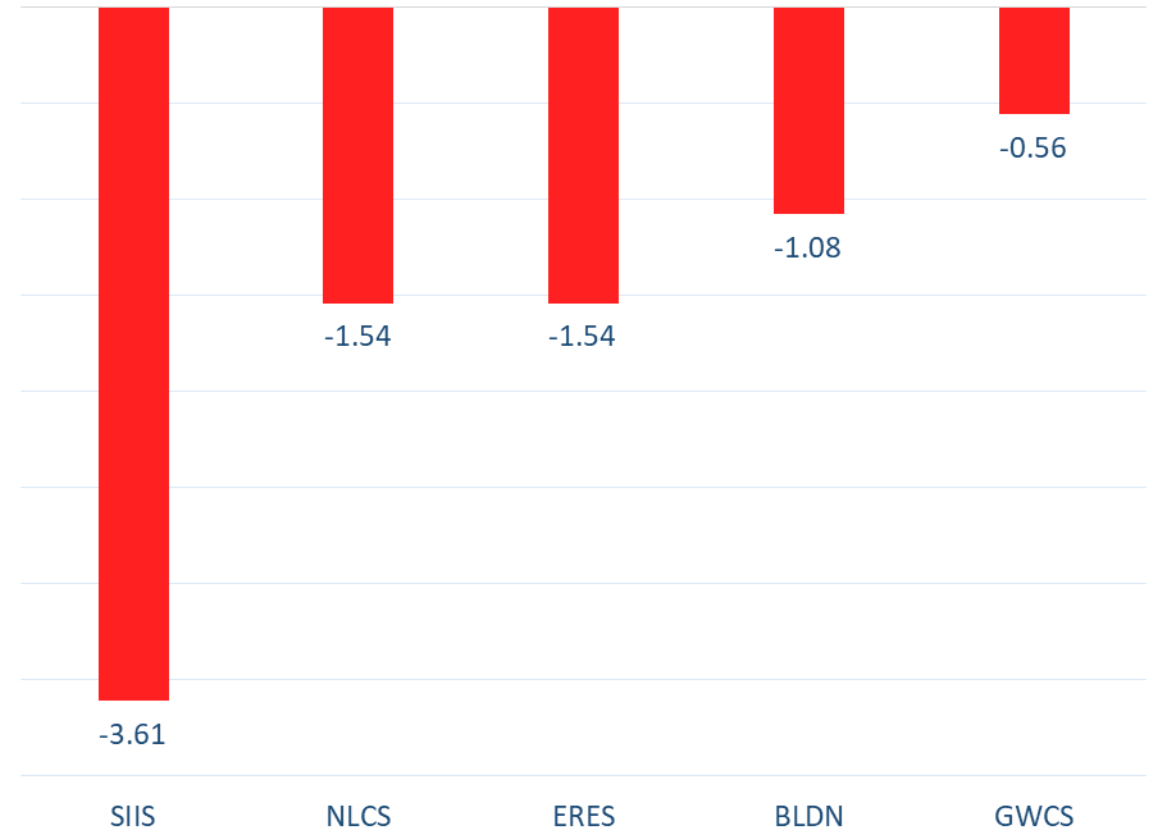
Top 5 Companies sold (net) by Foreigners over the last week