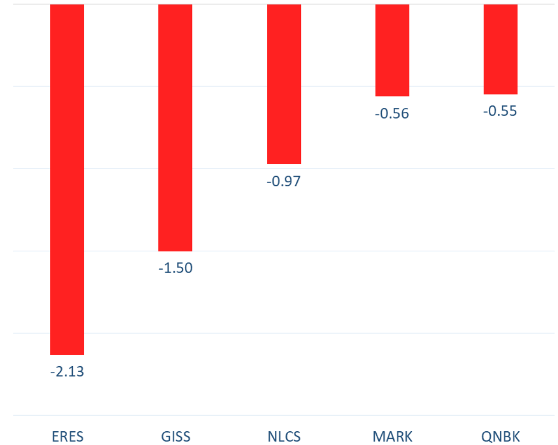
Top 5 Companies sold (net) by Foreigners in the last session