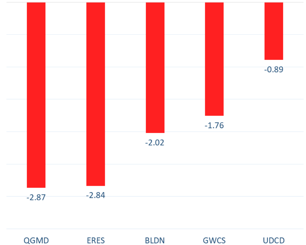
Top 5 Companies sold (net) by Foreigners over the last week