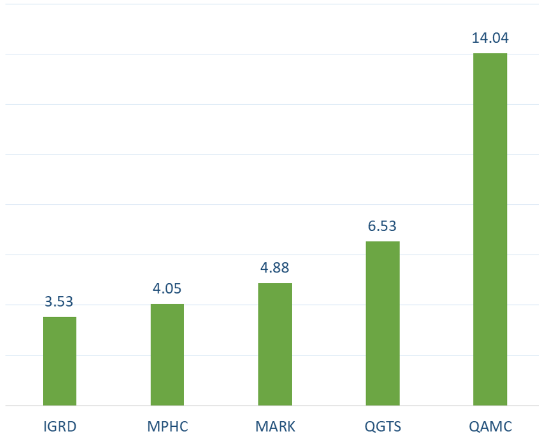
Top 5 Companies bought (net) by Foreigners over the last week