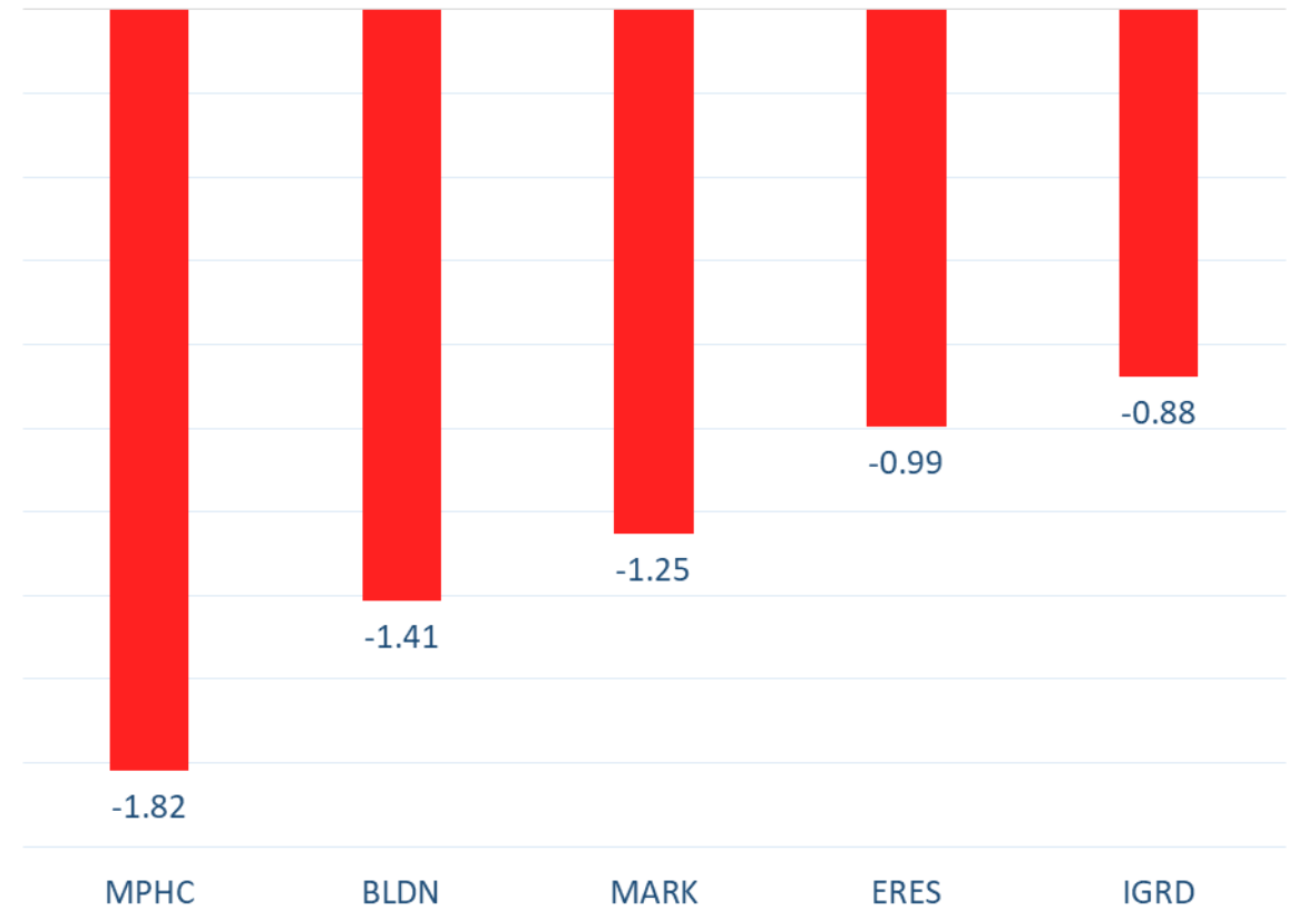
Top 5 Companies sold (net) by Foreigners in the last session