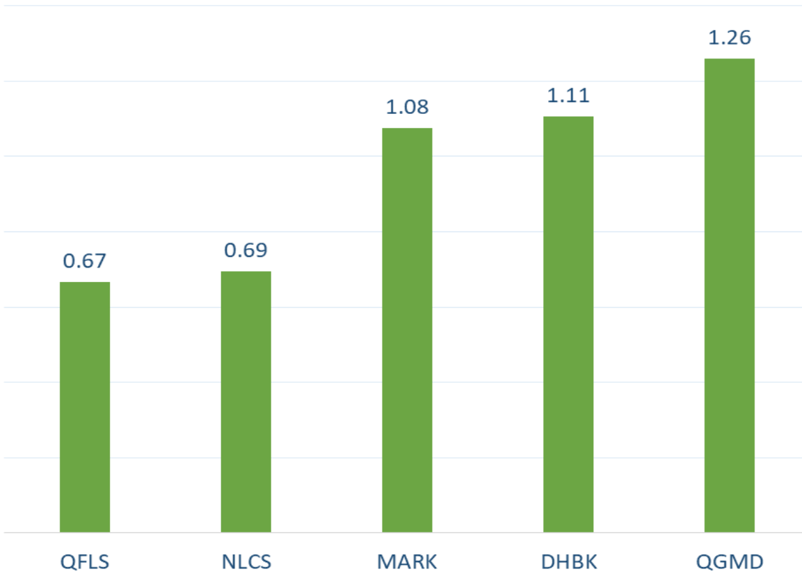
Top 5 Companies bought (net) by Foreigners in the last session