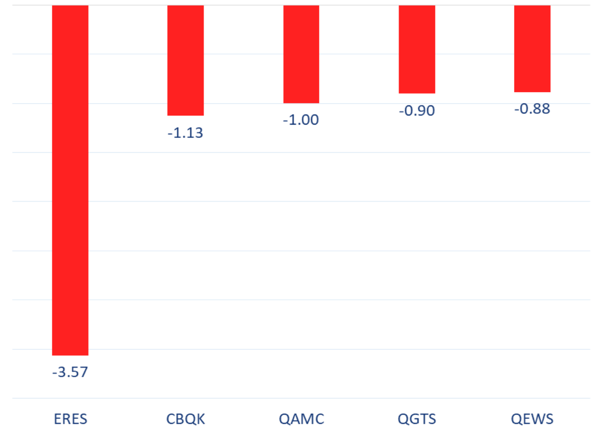
Top 5 Companies sold (net) by Foreigners over the last week