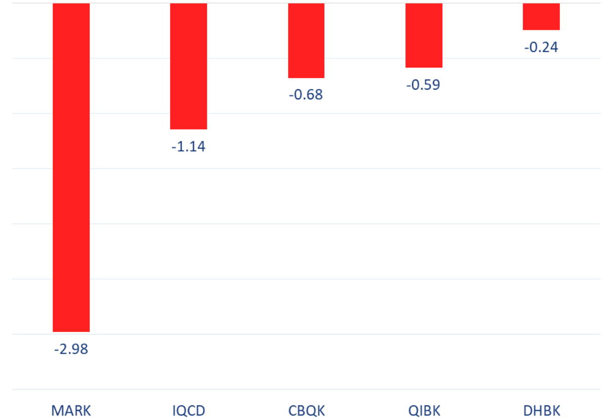
Top 5 Companies sold (net) by Foreigners in the last session