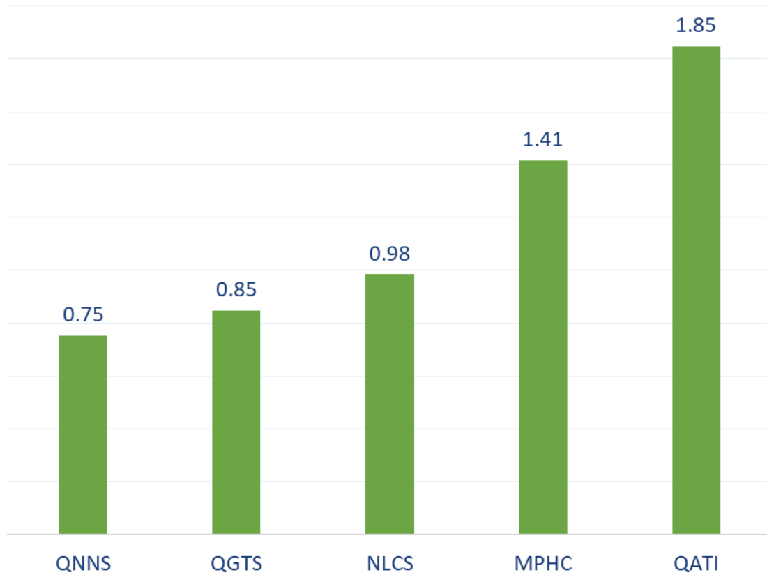
Top 5 Companies bought (net) by Foreigners in the last session