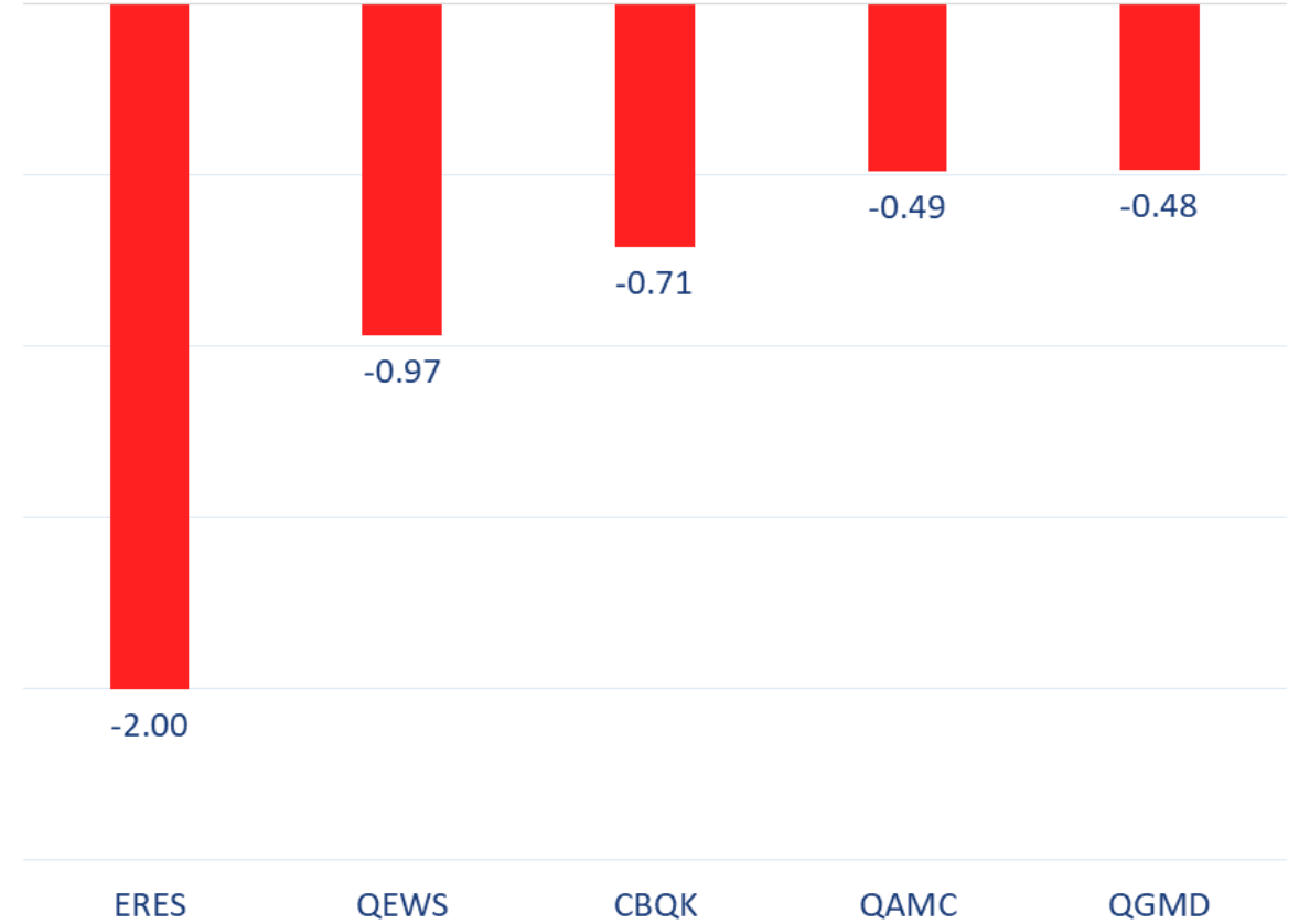
Top 5 Companies sold (net) by Foreigners over the last week