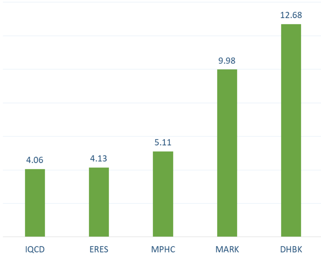
Top 5 Companies bought (net) by Foreigners over the last week