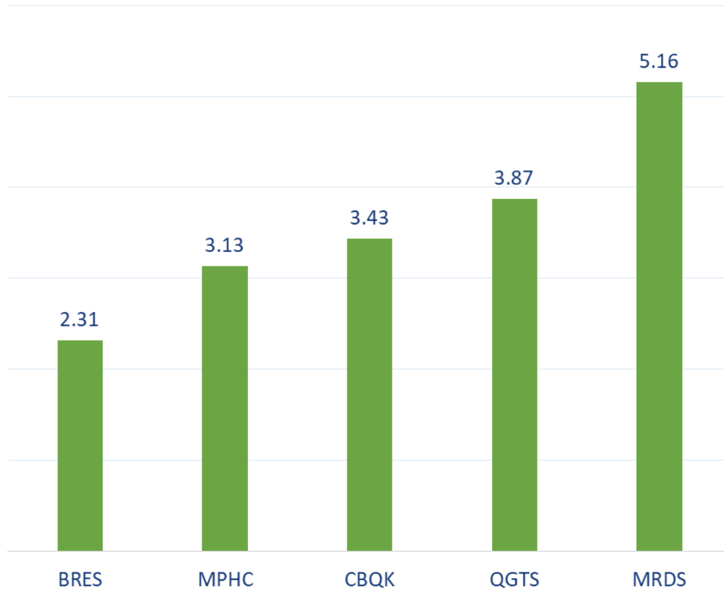
Top 5 Companies bought (net) by Foreigners over the last week