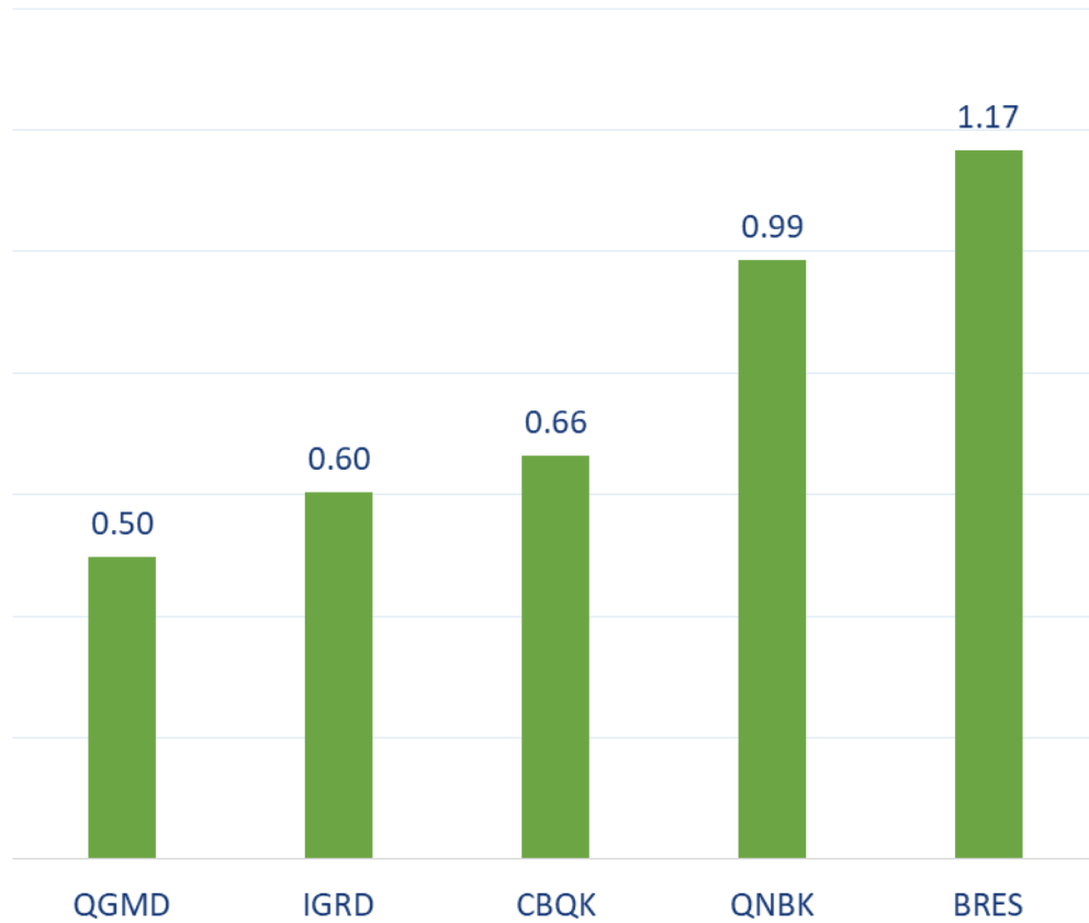
Top 5 Companies bought (net) by Foreigners in the last session