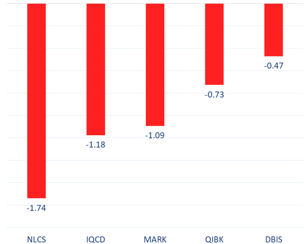
Top 5 Companies sold (net) by Foreigners in the last session