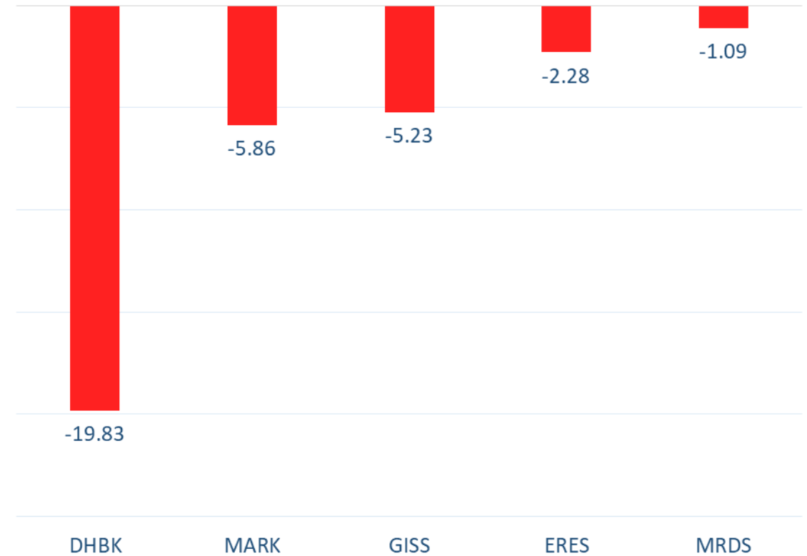
Top 5 Companies sold (net) by Foreigners over the last week