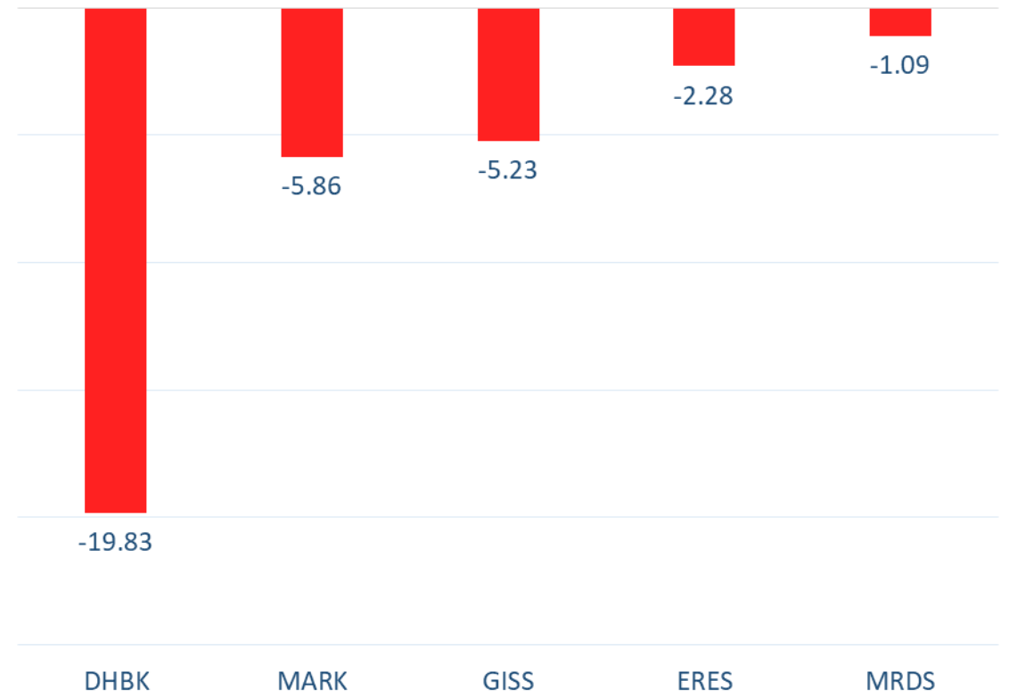
Top 5 Companies sold (net) by Foreigners over the last week