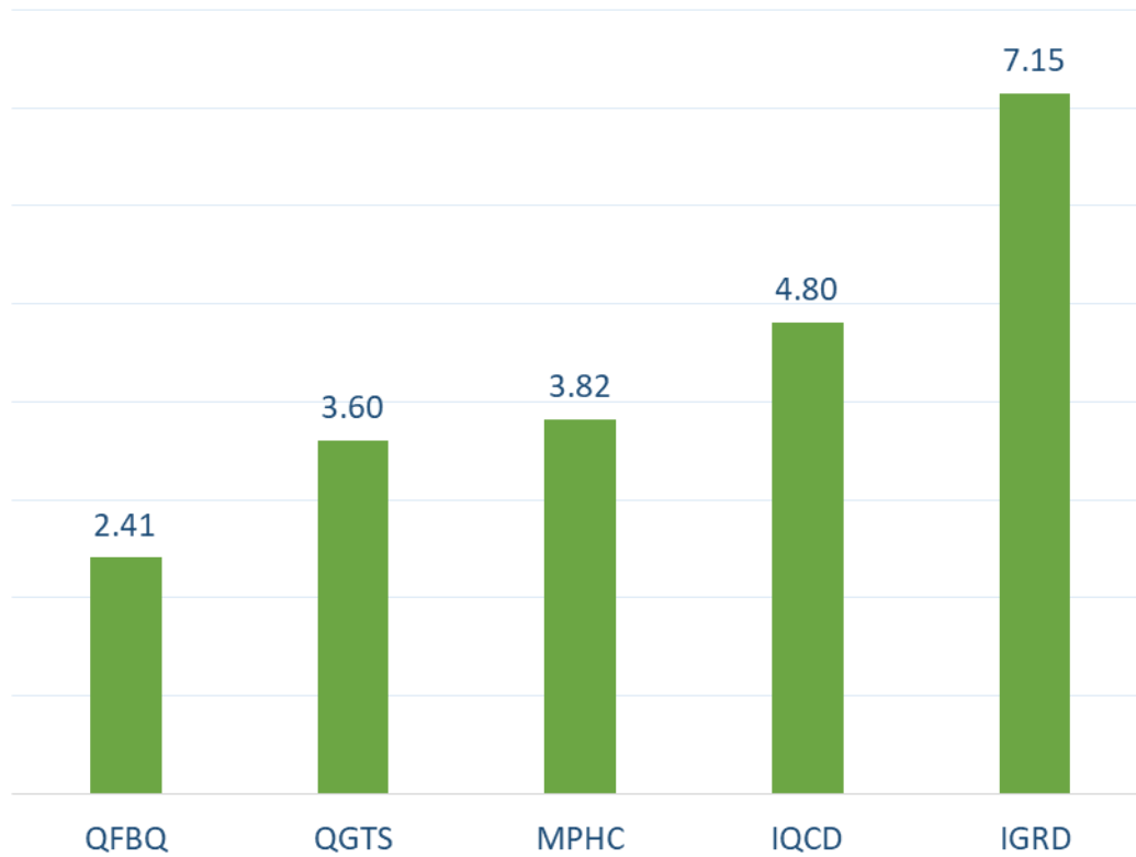
Top 5 Companies bought (net) by Foreigners over the last week