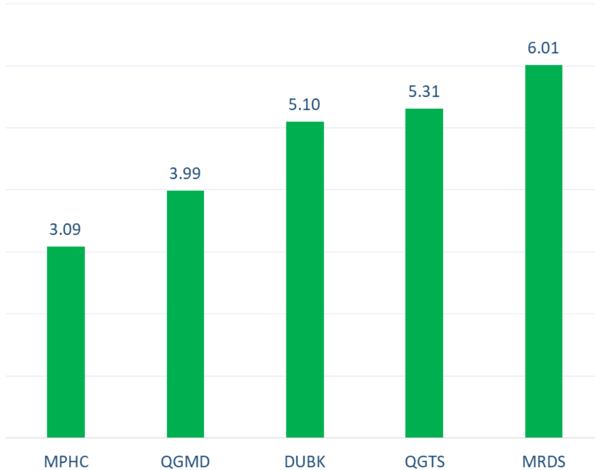
Top 5 Companies bought (net) by Foreigners over the last week