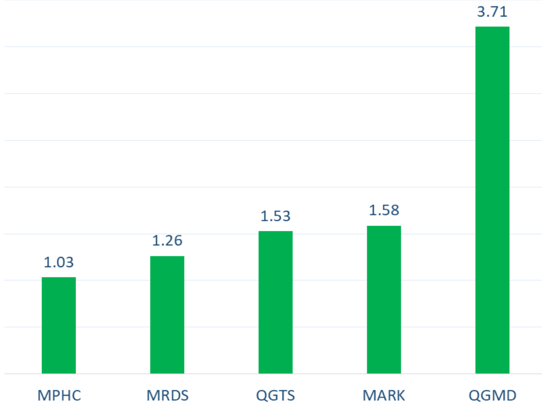
Top 5 Companies bought (net) by Foreigners in the last session