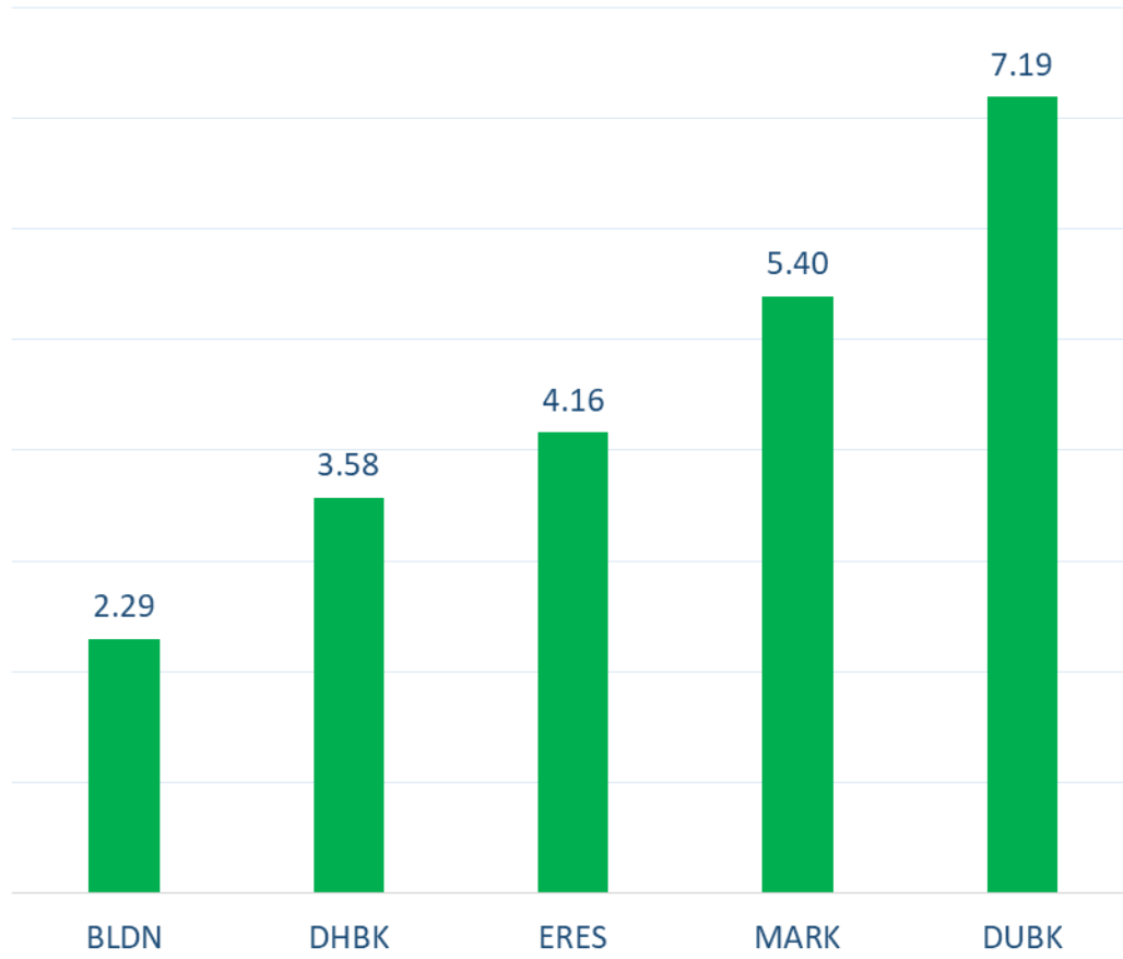
Top 5 Companies bought (net) by Foreigners over the last week