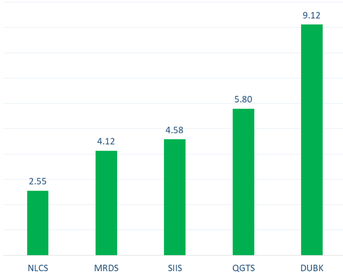
Top 5 Companies bought (net) by Foreigners over the last week