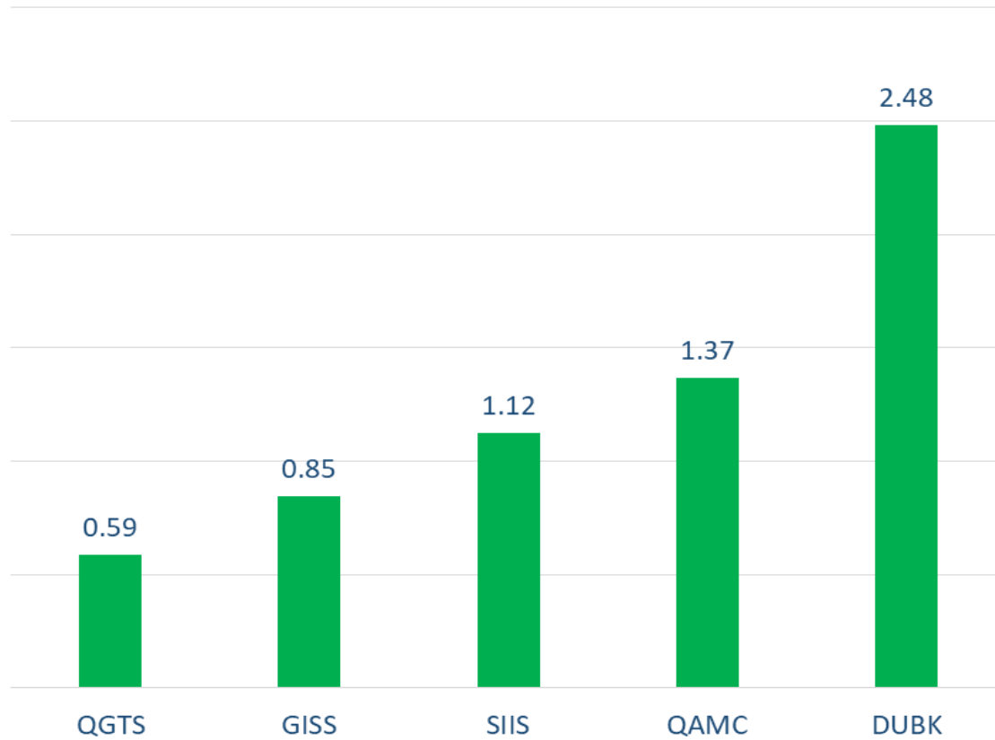
Top 5 Companies bought (net) by Foreigners in the last session