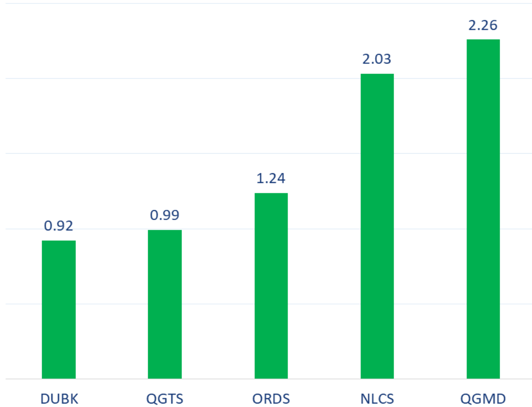
Top 5 Companies bought (net) by Foreigners in the last session