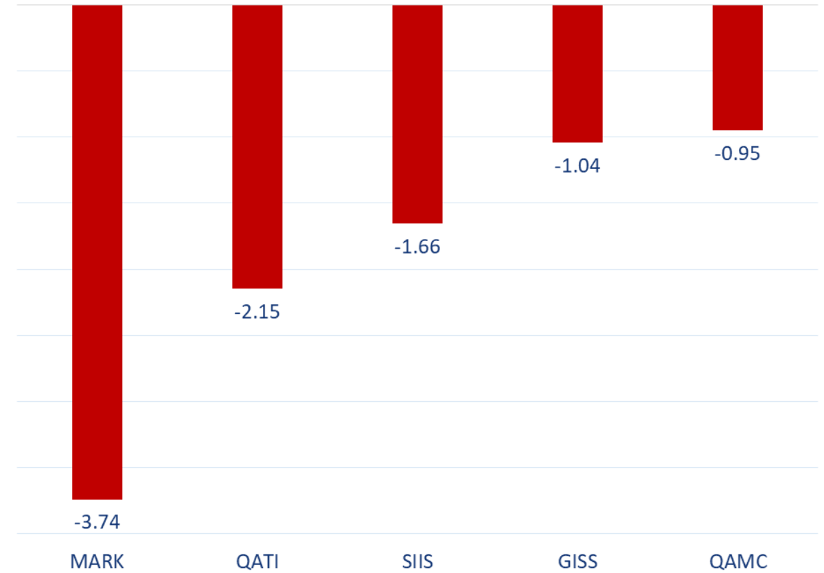
Top 5 Companies sold (net) by Foreigners in the last session