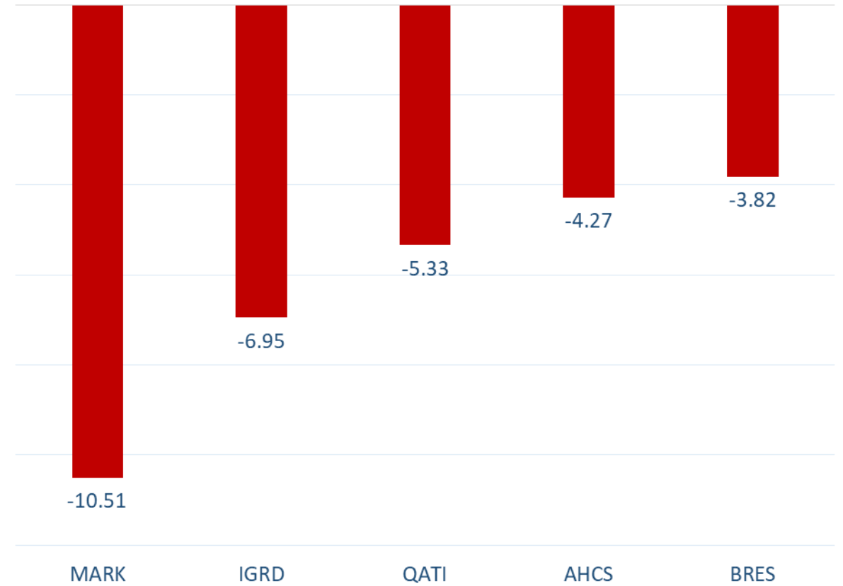
Top 5 Companies sold (net) by Foreigners over the last week