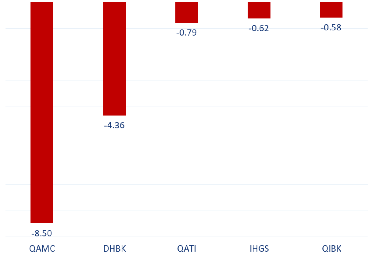
Top 5 Companies sold (net) by Foreigners over the last week