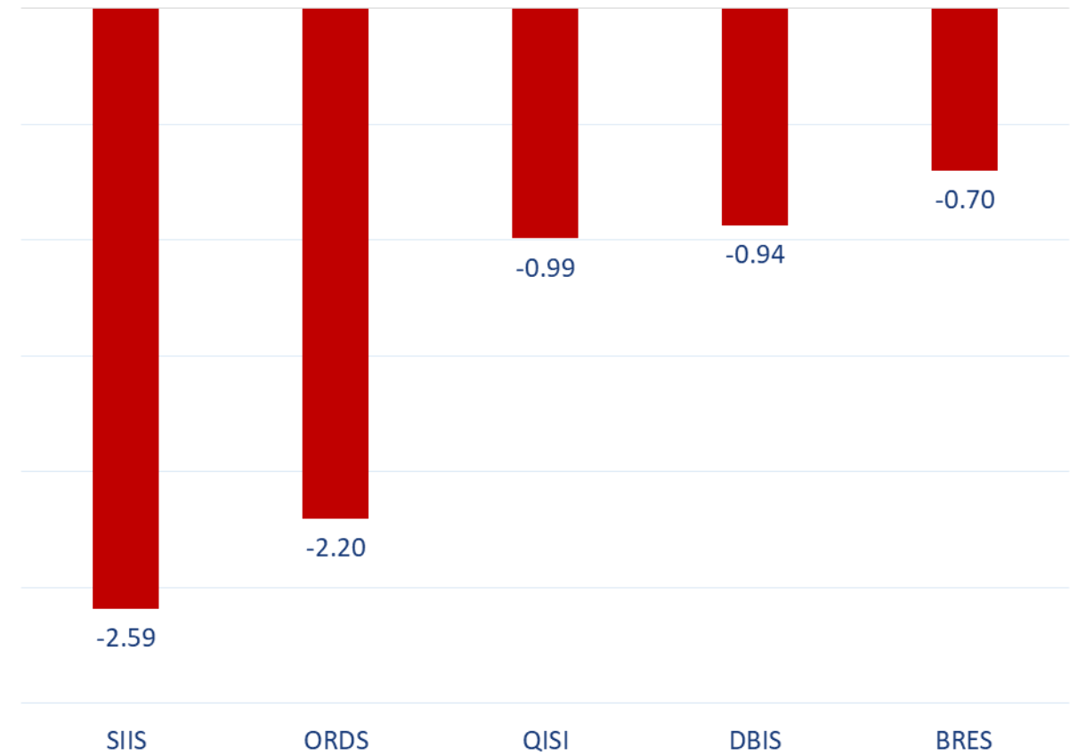
Top 5 Companies sold (net) by Foreigners in the last session