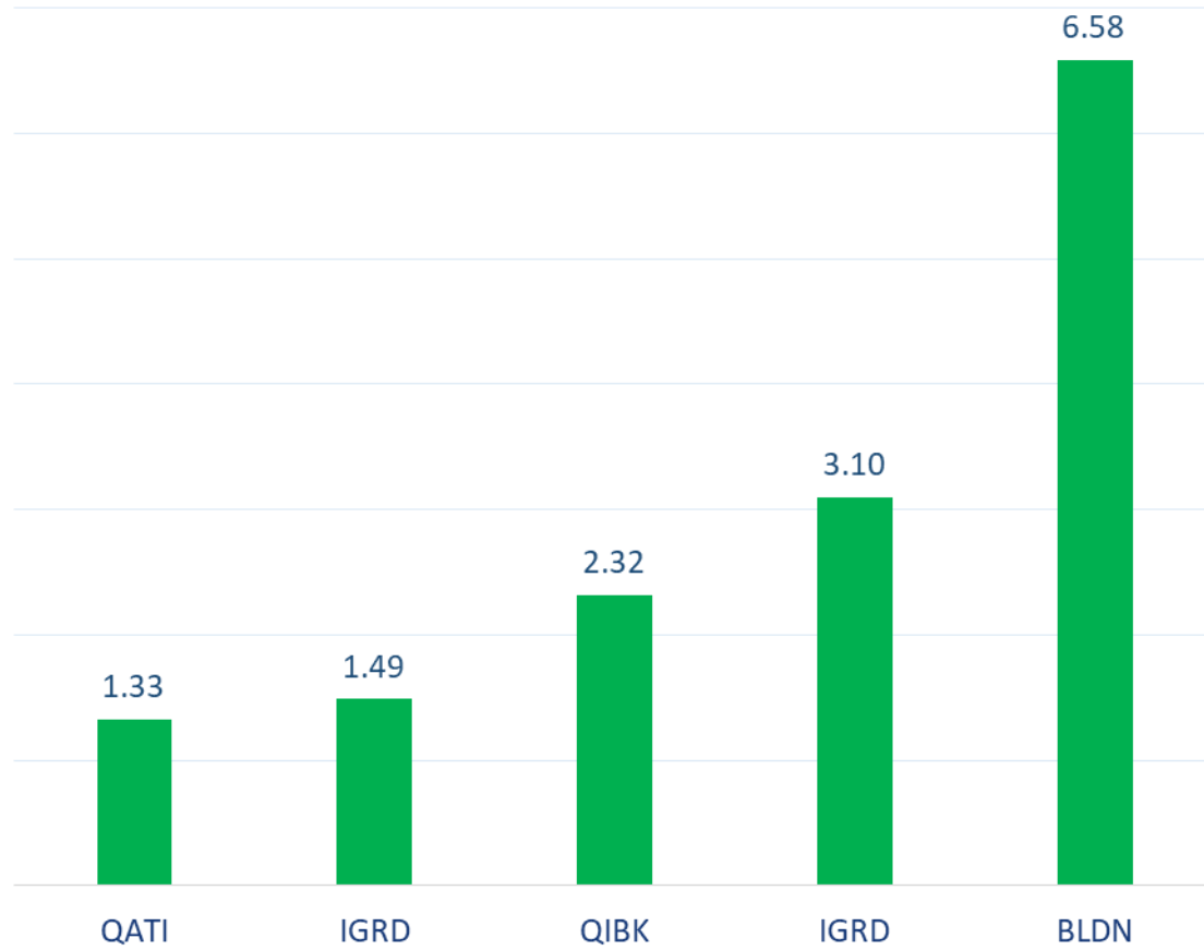
Top 5 Companies bought (net) by Foreigners in the last session