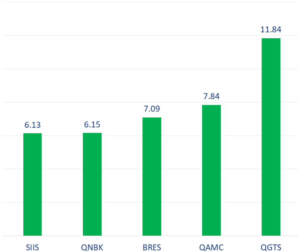
Top 5 Companies bought (net) by Foreigners over the last week