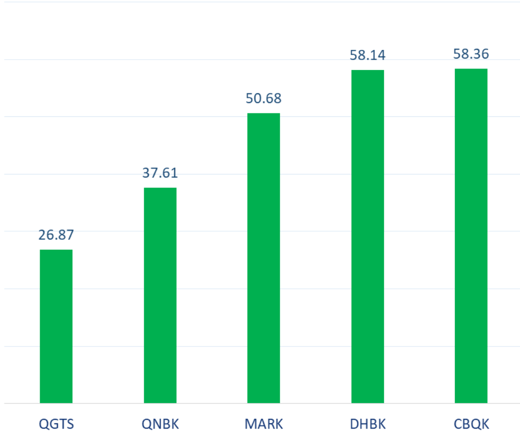
Top 5 Companies bought (net) by Foreigners in the last session