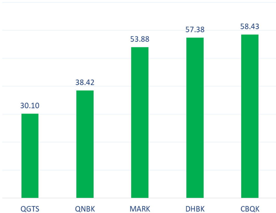
Top 5 Companies bought (net) by Foreigners over the last week