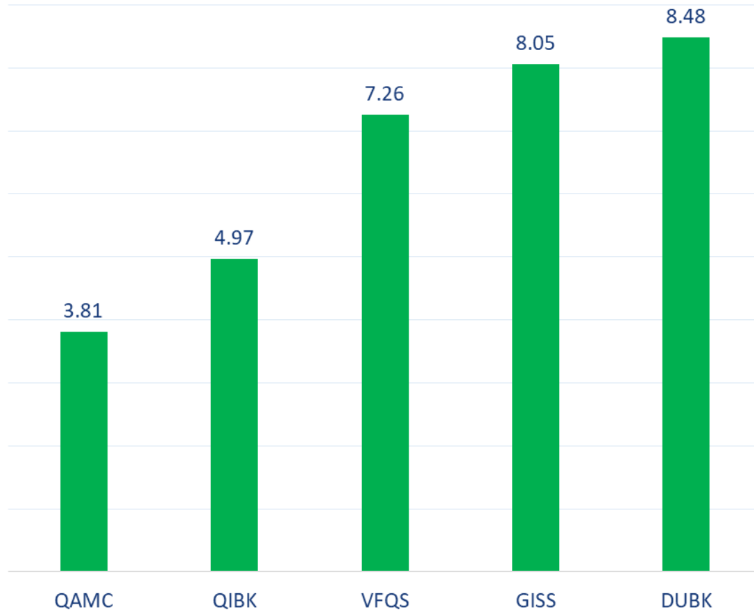
Top 5 Companies bought (net) by Foreigners over the last week