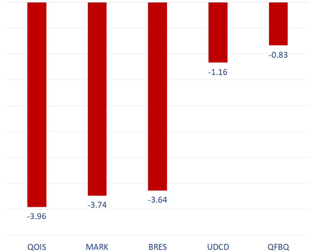
Top 5 Companies sold (net) by Foreigners over the last week