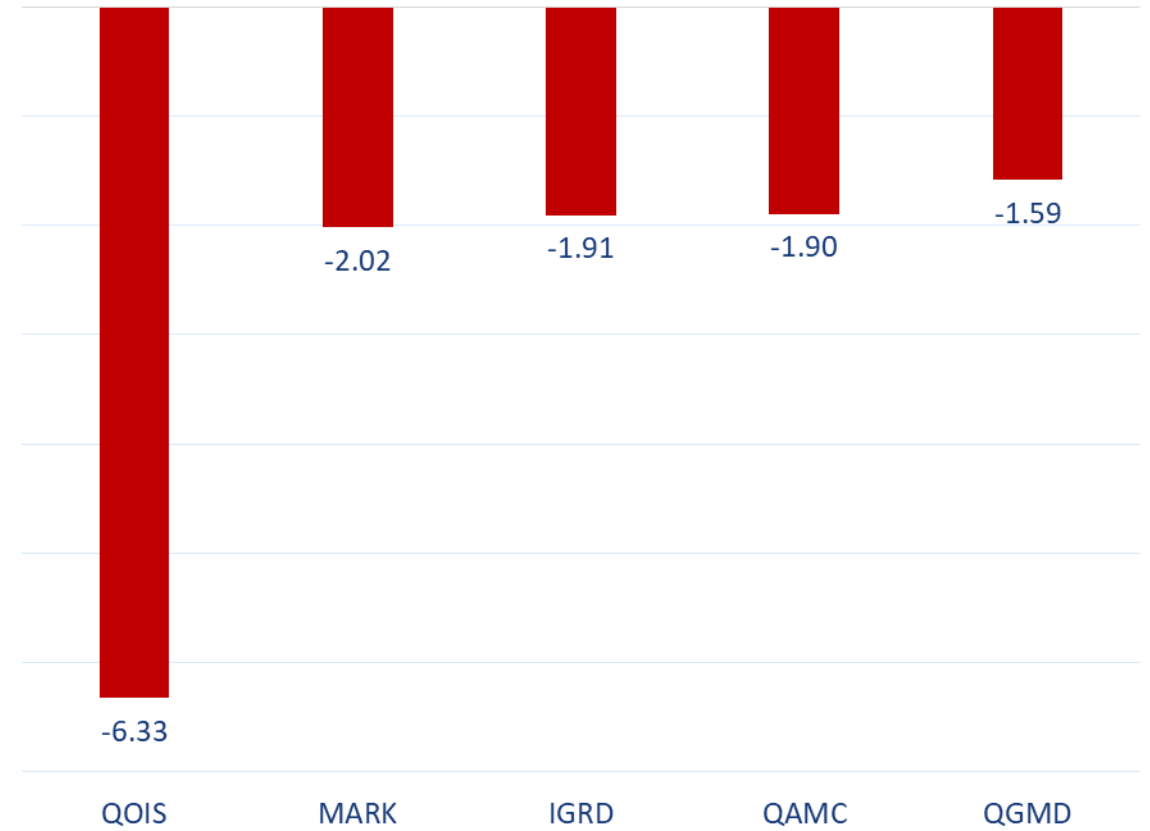
Top 5 Companies sold (net) by Foreigners over the last week