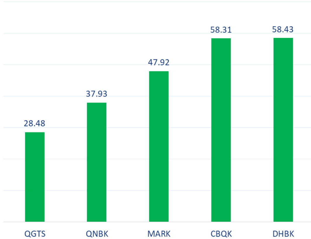
Top 5 Companies bought (net) by Foreigners over the last week