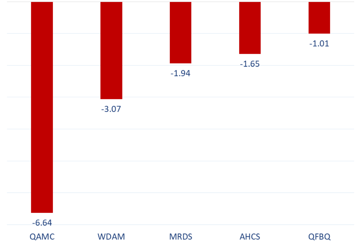
Top 5 Companies sold (net) by Foreigners over the last week