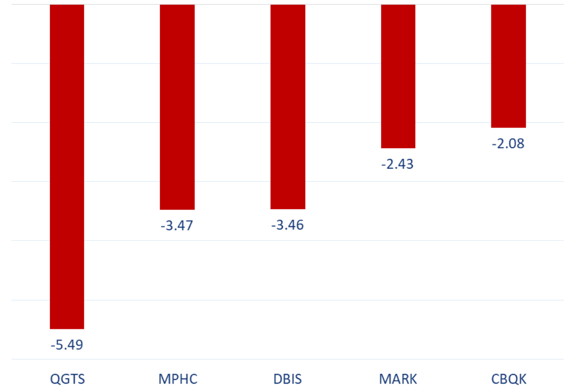
Top 5 Companies sold (net) by Foreigners over the last week