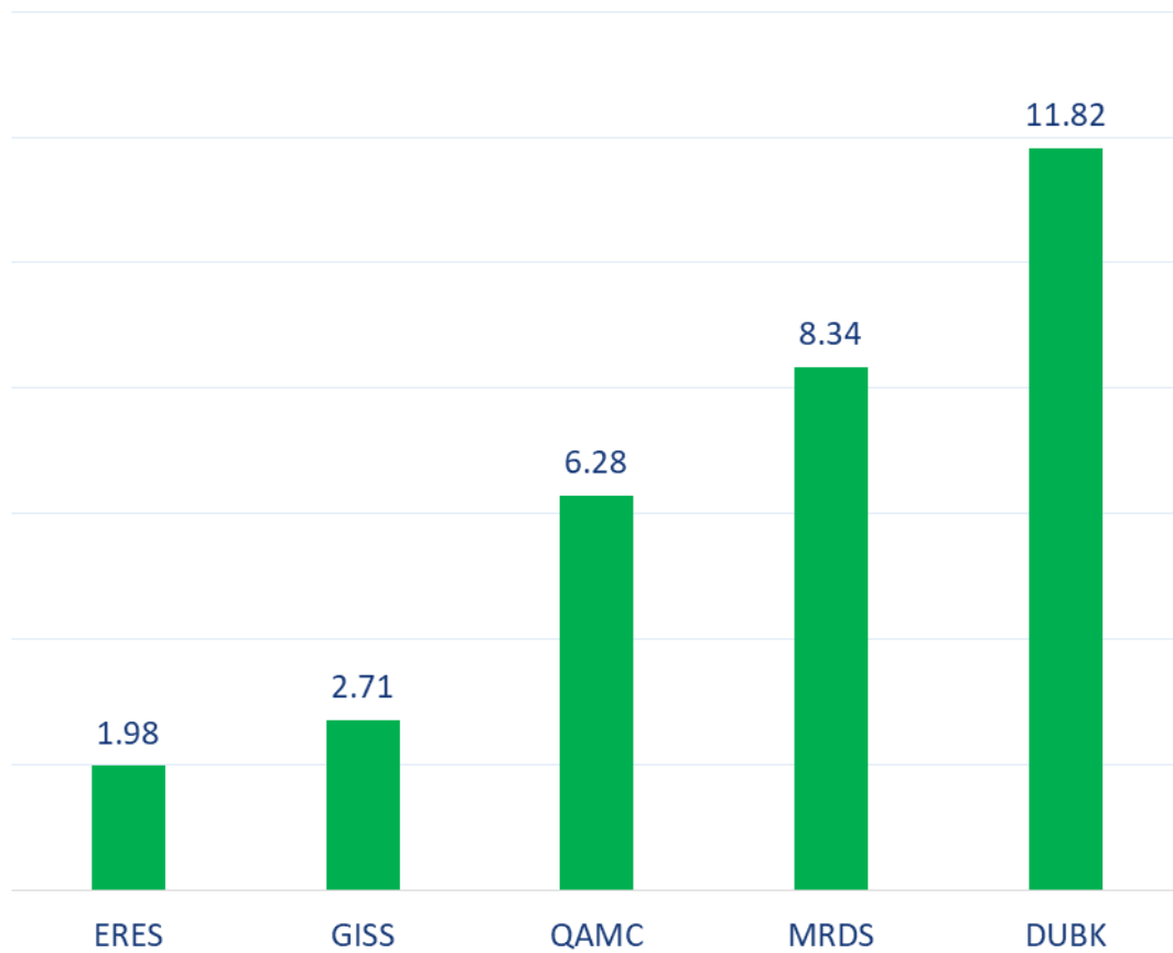
Top 5 Companies bought (net) by Foreigners over the last week