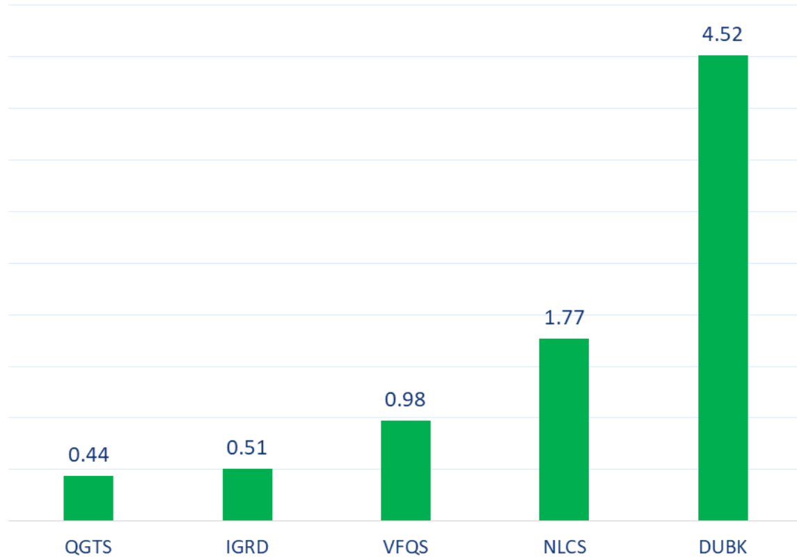
Top 5 Companies bought (net) by Foreigners in the last session