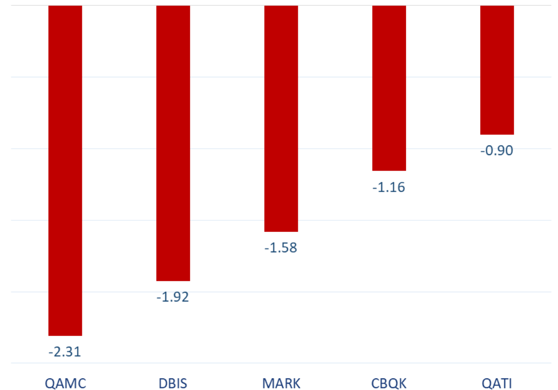
Top 5 Companies sold (net) by Foreigners in the last session