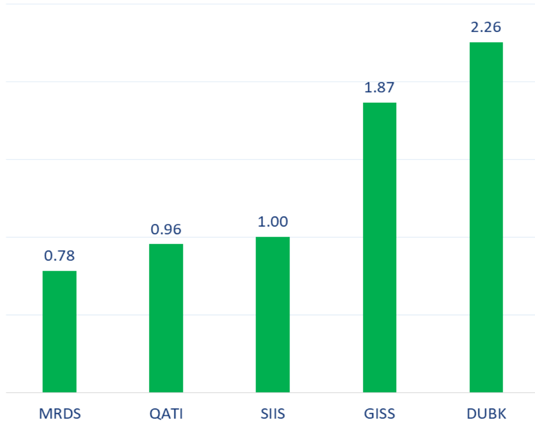
Top 5 Companies bought (net) by Foreigners in the last session