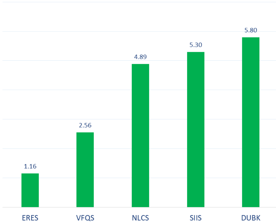
Top 5 Companies bought (net) by Foreigners over the last week