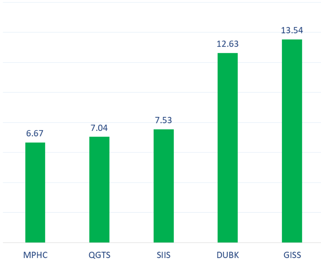
Top 5 Companies bought (net) by Foreigners over the last week