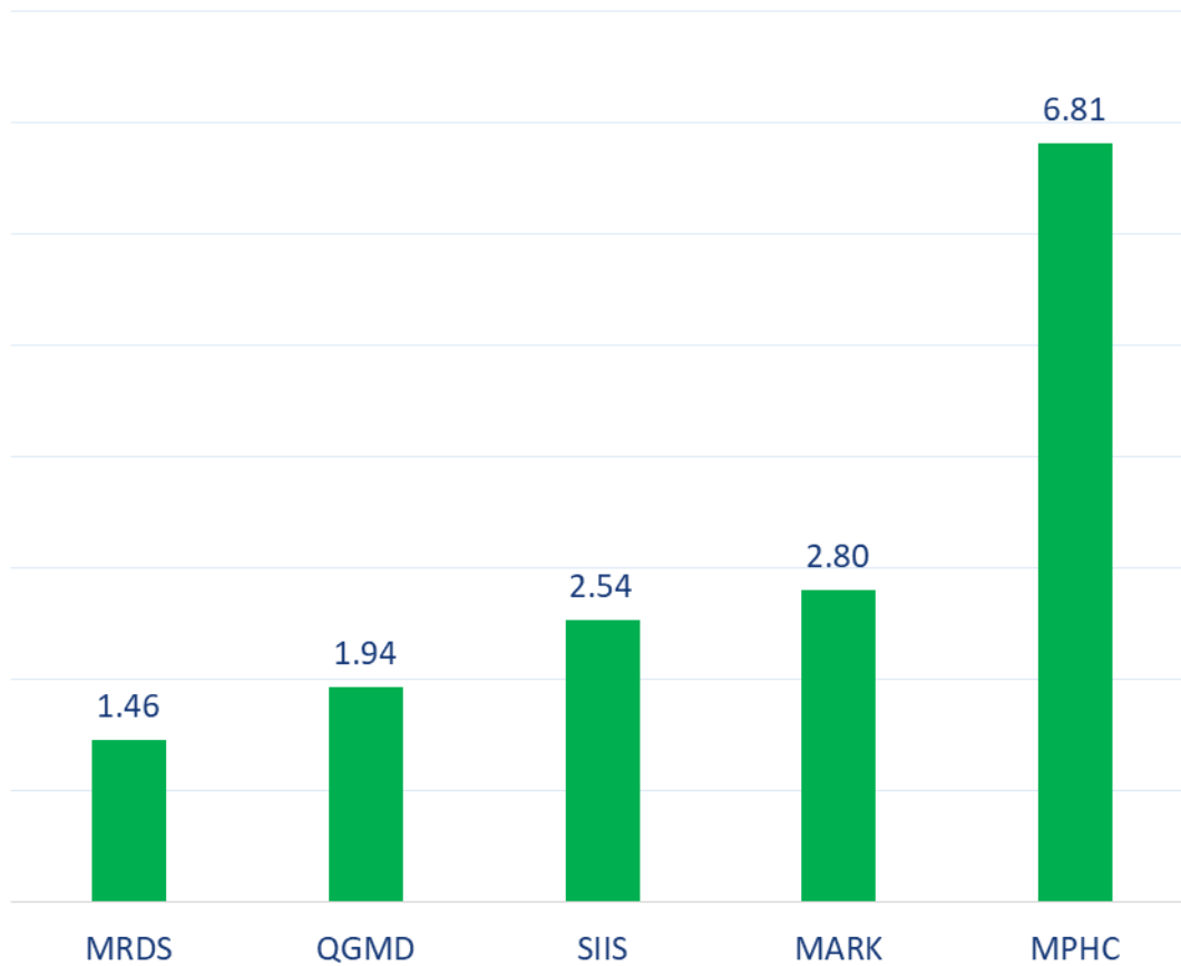
Top 5 Companies bought (net) by Foreigners in the last session