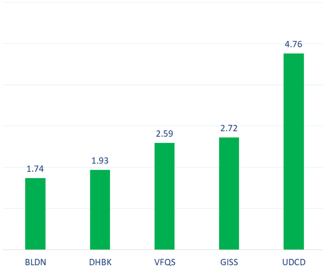
Top 5 Companies bought (net) by Foreigners over the last week