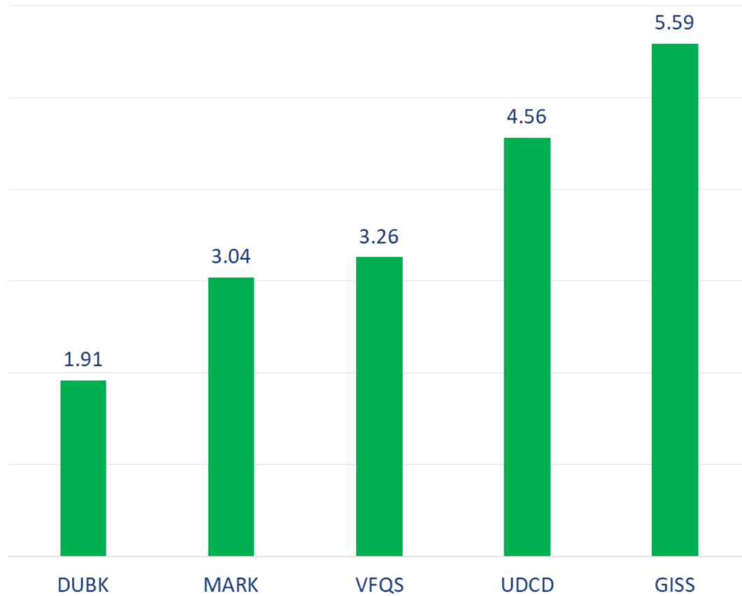
Top 5 Companies bought (net) by Foreigners over the last week