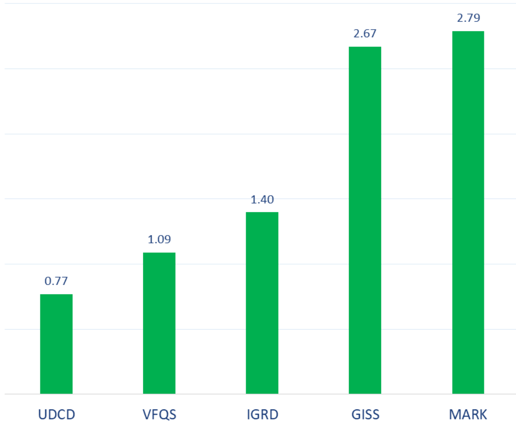
Top 5 Companies bought (net) by Foreigners in the last session