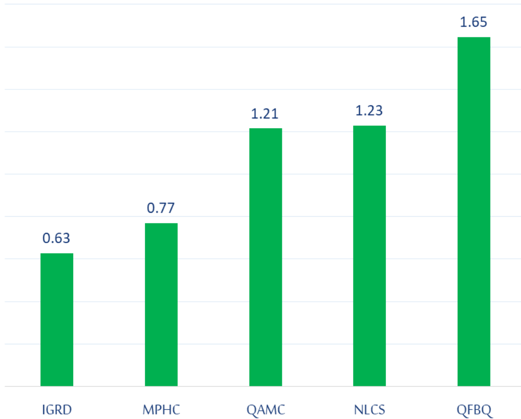
Top 5 Companies bought (net) by Foreigners in the last session