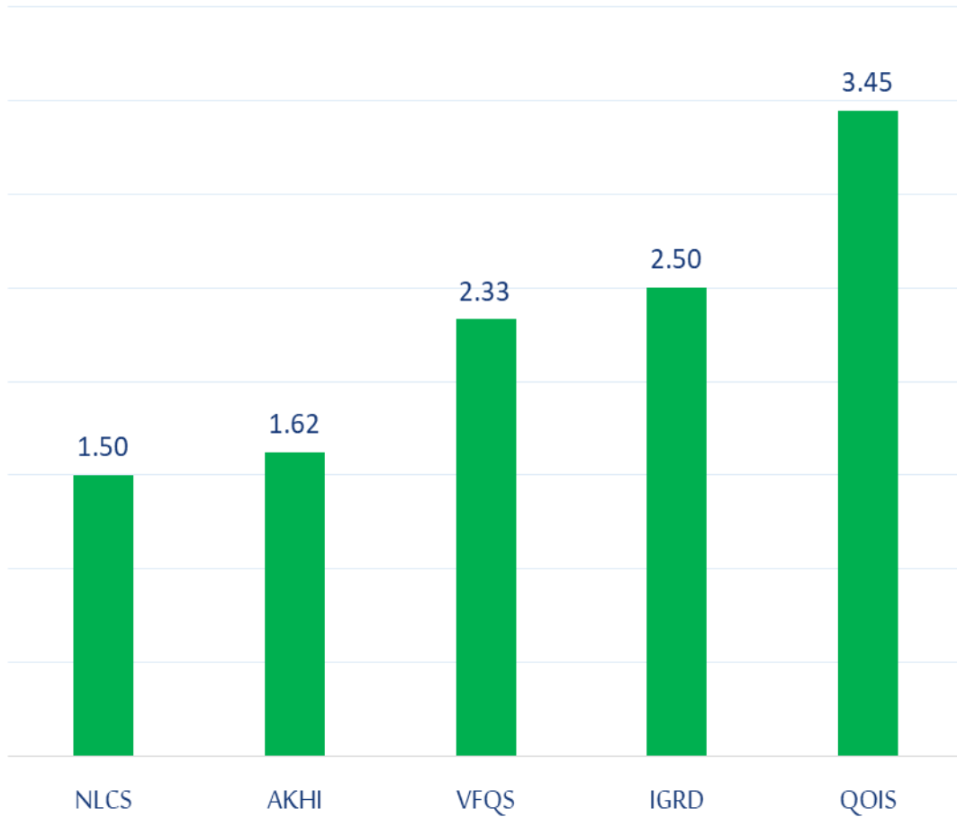
Top 5 Companies bought (net) by Foreigners over the last week