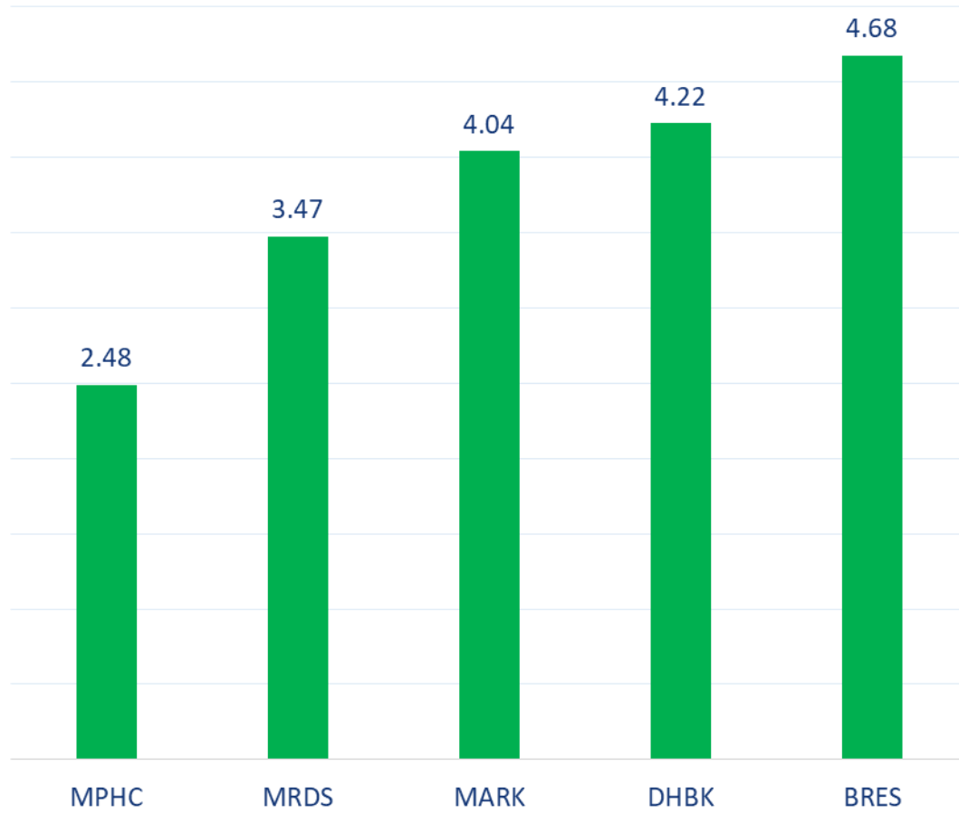
Top 5 Companies bought (net) by Foreigners over the last 5 Sessions