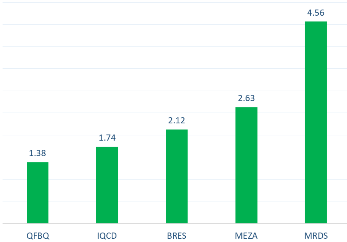
Top 5 Companies bought (net) by Foreigners over the last week