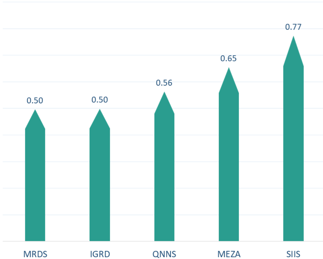
Top 5 Companies bought (net) by Foreigners in the last session