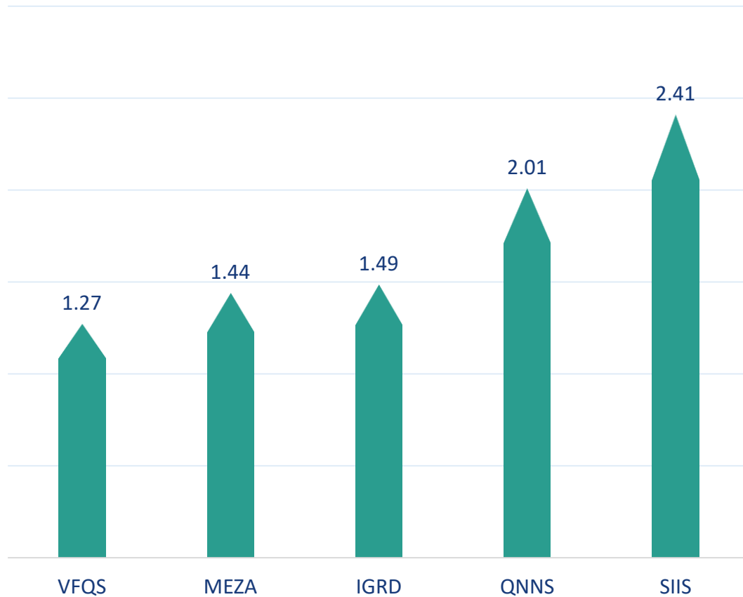
Top 5 Companies bought (net) by Foreigners over the last 5 Sessions