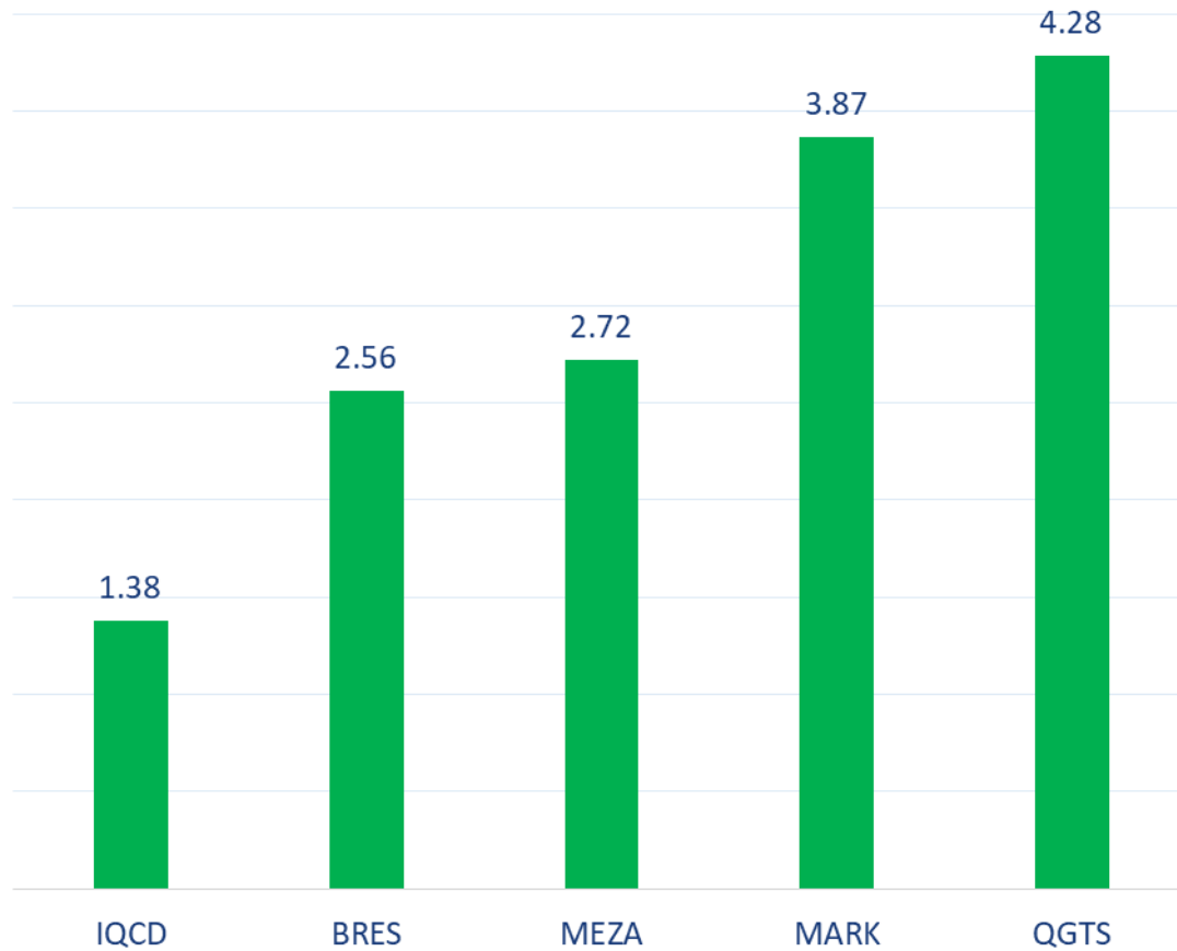
Top 5 Companies bought (net) by Foreigners over the last 5 Sessions