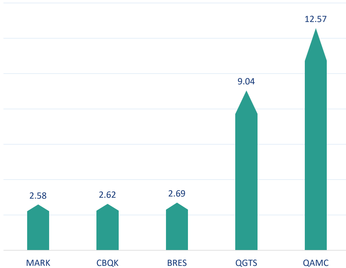
Top 5 Companies bought (net) by Foreigners over the last 5 Sessions