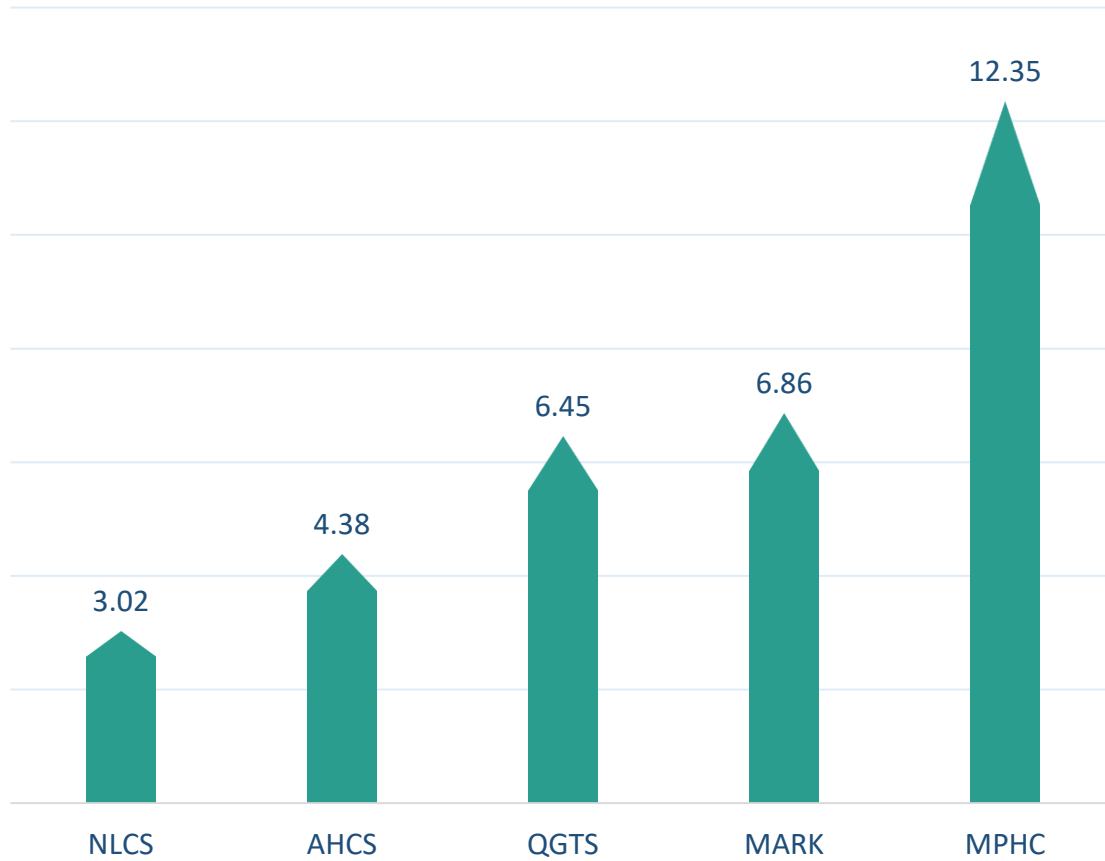
Top 5 Companies bought (net) by Foreigners over the last 5 Sessions