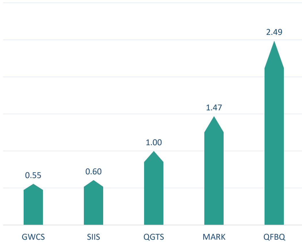
Top 5 Companies bought (net) by Foreigners in the last session