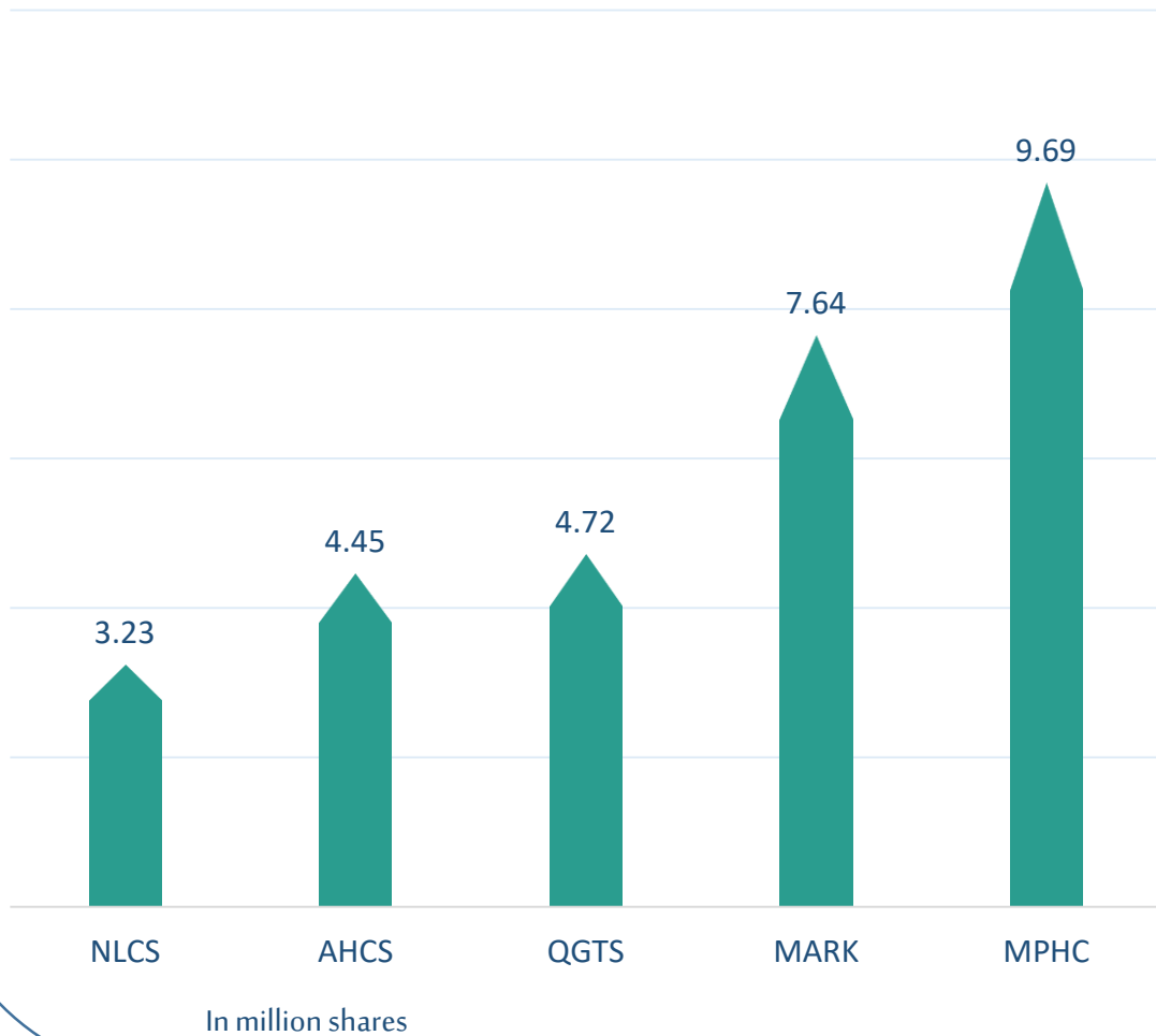
Top 5 Companies bought (net) by Foreigners over the last 5 Sessions