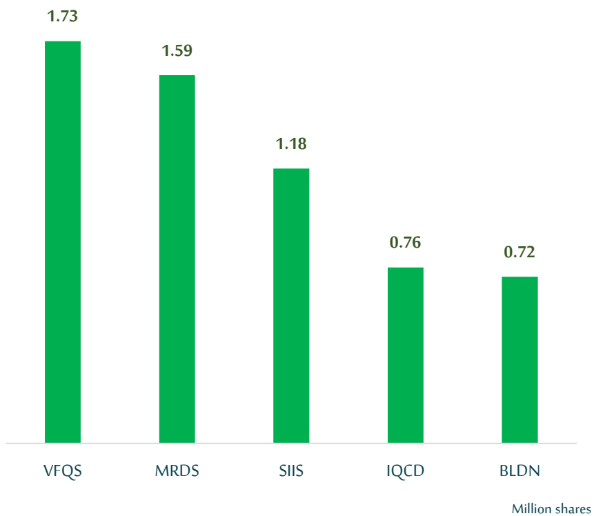
Top 5 Companies bought (net) by foreigners in the last session